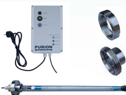
picture: PURION weld in UV-Set 48 W & optionally with splinter protection

...is characterised by an extraordinarily high disinfection performance with compact design and low energy consumption. It is designed in accordance with applicable laws, standards and guidelines.